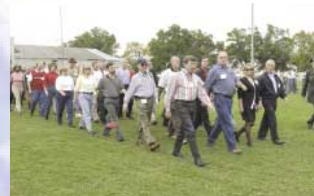
The alumni platoon shows they still have what it takes during the alumni parade.