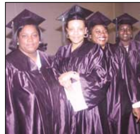
Graduates from the Valdosta campus anxiously await their commencement ceremony.