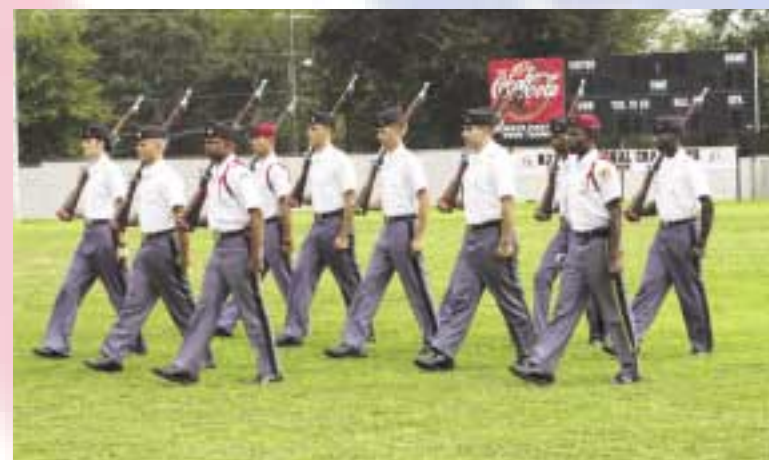
The nationally-ranked GMC junior college Old Capitol Guard drill team performs on Davenport Field before the parade.