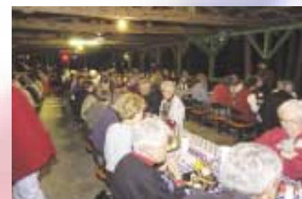
Alumni and friends enjoy delicious food and prepare to listen to alumni storytelling during the Friday night social at the GMC lake lot.